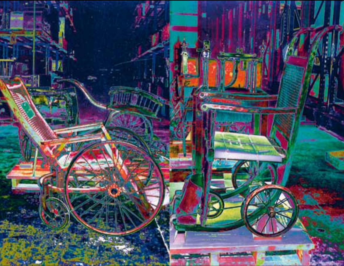
Wheels on Fire 1–6 © Ju Gosling aka ju90, 2003.