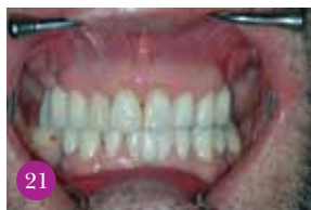
Figs 20 and 21 Direct, free-hand composite bonded to the lingual enamel as well as the incisal enamel, provided it is placed in thick section, does well. 2

strength of the teeth, then, in my view, addition beats subtraction when dealing with wear and many other cosmetic problems. In other words, it is more sensible to add to the worn or irregular teeth than to reduce the damaged teeth even further, both for reasons of strength and also for the preservation of residual pulpal health.