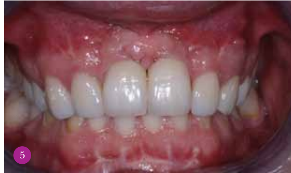
Fig 5 This patient apparently lost two front teeth (now replaced with implants) as well as the nerves of three teeth.

When an air rotor assault is launched on virtually intact teeth, the innocent dental pulps are given no chance to retreat. Extensive preparation of intact teeth for ceramic-based crowns is very different to preparing teeth that have been previously attacked by dental caries. Caries is a slow process and often gives the pulp a chance to retreat and lay down secondary or reparative dentine. No such warning is available for the intact teeth undergoing preparation: the high pitched whine of an air rotor signals the imminent stripping of their invaluable enamel