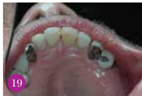
Figs 18 and 19 Bonding of the worn teeth at an increased anterior vertical dimension meant there was space created for the metal pads without removing any of the residual worn (but valuable) enamel.