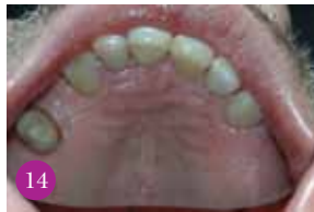
Figs 11, 12, 13 and 14 Bleaching and bonding of the dark worn teeth with composite does not damage the pulps or the load bearing structure of the teeth.