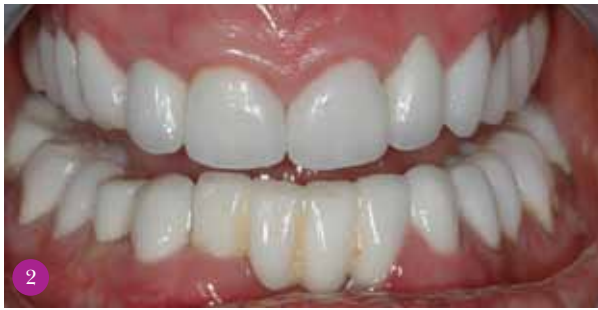
Fig 2 Patient as presented (apparently cured of PDD)