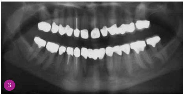
Fig 3 Six dead teeth as a result of the treatment for hyperenamelosis by application of porcelain bonded to metal crowns and bridges.