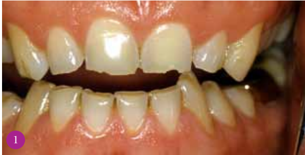
Fig 1 Teeth that are 'mainly intact', ie with mild wear that could be addressed through less aggressive treatment such as bleaching and bonding to achieve the 'nice smile' the patient desires.