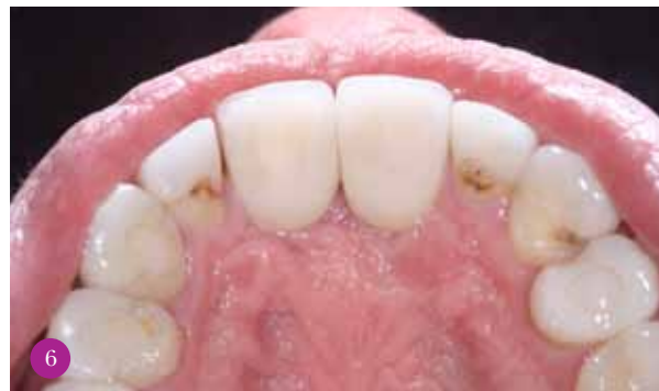
Fig 6 The upper right canine and both upper premolars had to be root filled following preparations for this porcelain pornography.

'double mugging': these unfortunate patients are being robbed twice – first of their money and again of their enamel and dentine