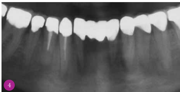
Fig 4 Section of the orthopantomogram showing areas of obvious periapical rarefaction.

One article, recently published in a journal purporting to describe what is best in modern 'cosmetic dentistry', showed some mildly eroded and worn teeth at the lower right canine, lateral incisor, central incisor and lower left central incisor. There was little evidence of significant wear of the lower left lateral incisor, canine or first or second premolars. There was also no sign of active periodontal disease around any of these lower teeth but there was some minor gingival recession that was probably of no real clinical significance. The upper anterior teeth appeared to have been previously crowned or veneered, and showed some associated minor gingival inflammation.