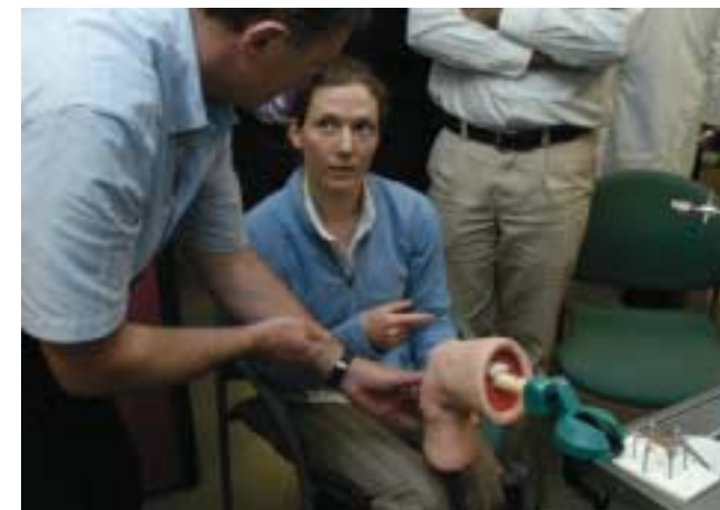
Far left: Basic surgical skills training course held at the Welsh Institute for Minimal Access Therapy, Cardiff.

During 2006 and 2007, the ISCP will continue to have a major influence on the College's regional work and, during this time, the College will further explore the concept of schools of surgery, which is based on the aim of developing roles, responsibilities and partnerships between the Trusts, deans and the College within each deanery. It is hoped that 2006 will see schools of surgery piloted in the five deaneries currently taking part in ISCP pilots, thus providing an effective organisational structure to manage educational resources and support the trainer–trainee partnership during and after curriculum reform.