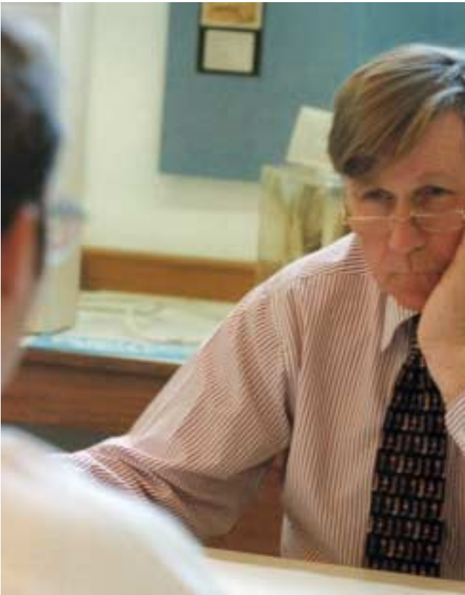
Viva examination held in the College's Wellcome Museum of Anatomy and Pathology.

Since 1998, the College and surgical specialist associations have supported nearly 100 NHS Trusts in maintaining and improving surgical standards and patient care through the invited review mechanism (formerly named the rapid response and service review arrangements).