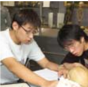
Above left: Operating theatre at St George's Healthcare NHS Trust, Tooting, London. Left: Students attending an open day at the College.