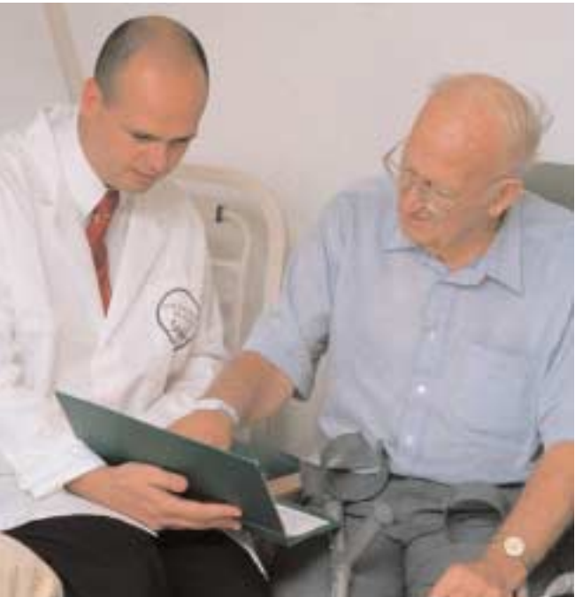
A research fellow from Southmead Hospital, Bristol, consulting with a patient as part of his research.