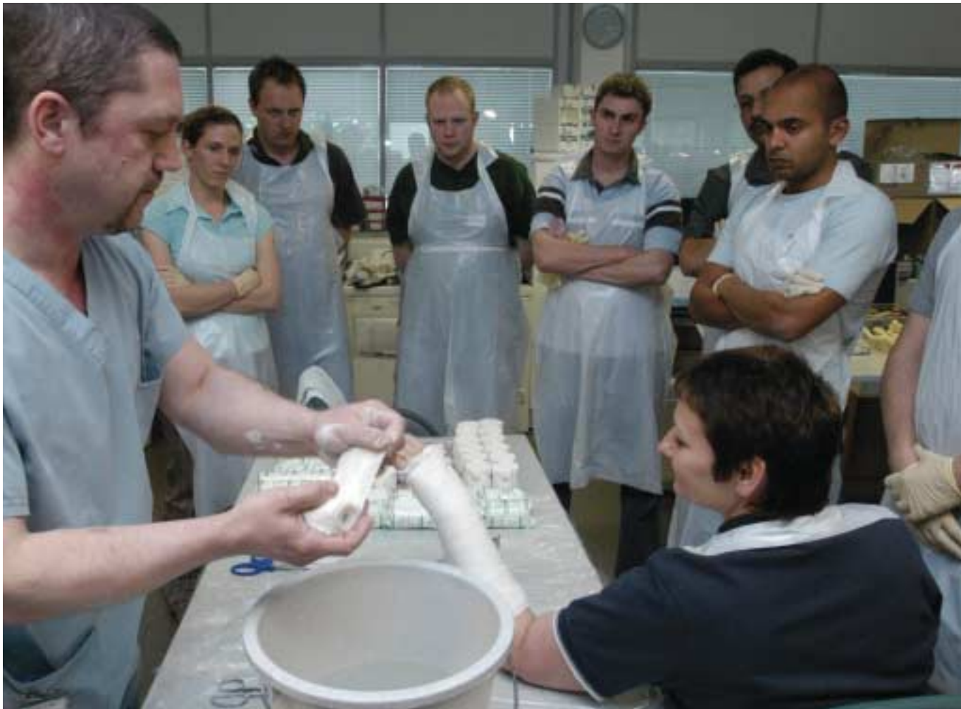
Team training held at the Welsh Institute for Minimal Access Therapy, Cardiff.

Extended Surgical Team Curriculum Recognising that the composition of the surgical team is evolving within the modernising NHS environment, the College developed a multidisciplinary working party engaging key stakeholders involved in the delivery of surgical services to consider the roles and responsibilities of the whole, or ‘extended’, surgical team.