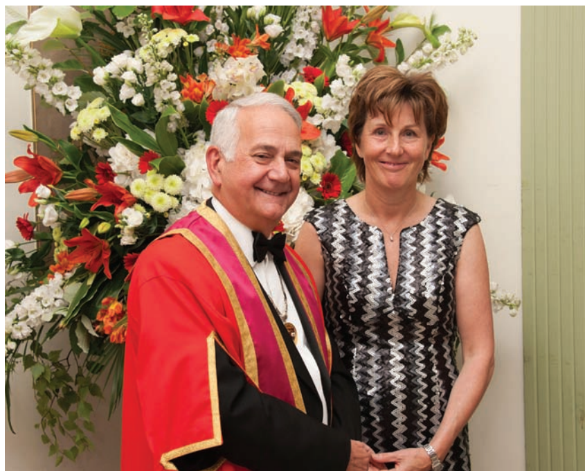
Left: Guests at the Dinner