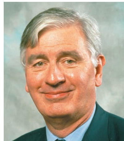
CHAIRMAN The Dean